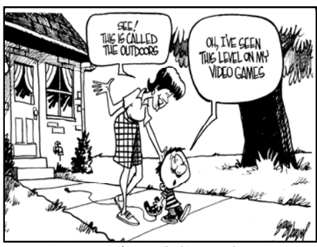
By permission of Gary Varvell and Creators Syndicate, Inc.

If they are not used to playing outside, you may quickly hear complaints like, "I'm bored," and, "There's nothing to do out here." Don't give in! Children have an incredible talent for making up play, but it may take them awhile to get going. You can set an example: be the first one to splash in