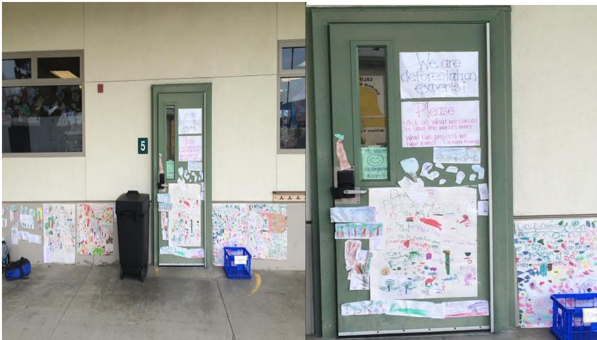
Figure 2. Deforestation Posters