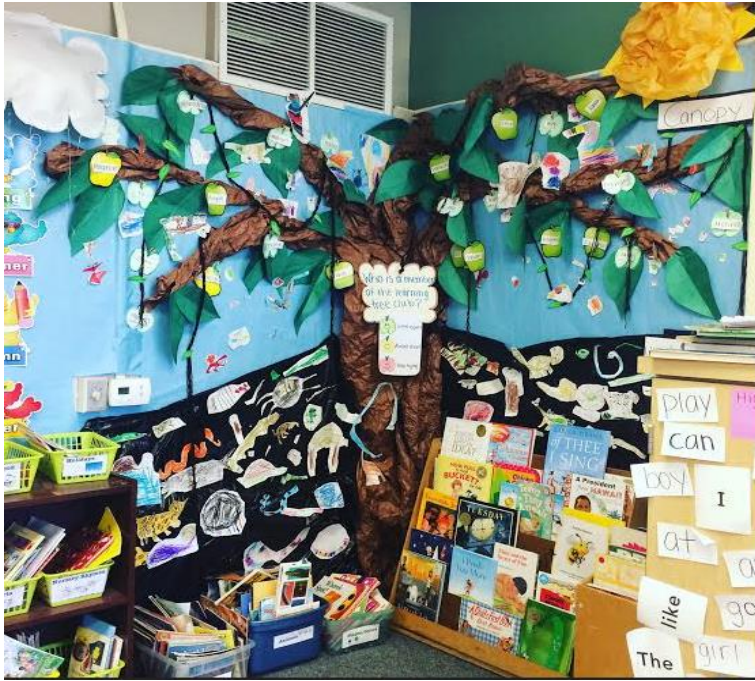
Figure 1. Class Amazon Rainforest Tree