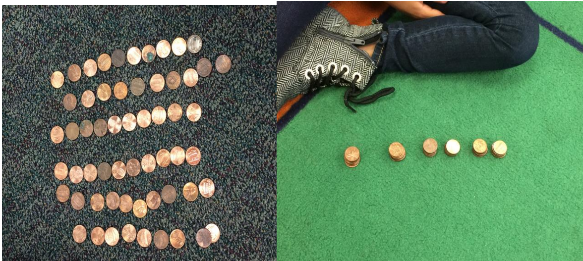
Figure 4. Penny Drive Counting Pictures