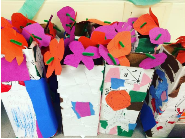
Figure 3. Upcycled Mother's Day Vases with Flowers