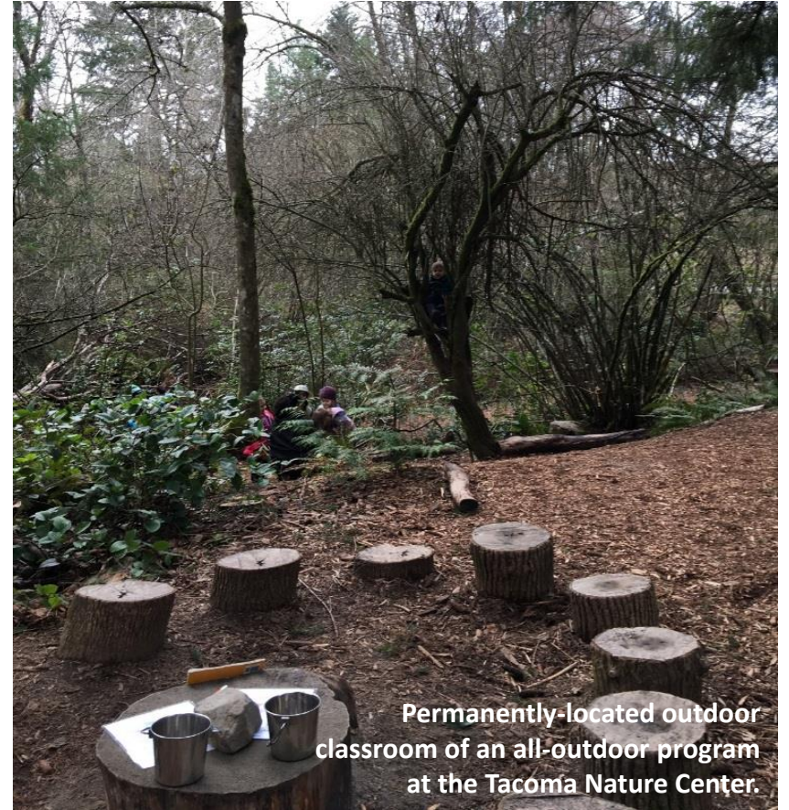
Permanently-located outdoor classroom of an all-outdoor program at the Tacoma Nature Center.